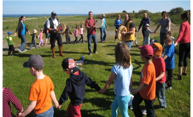
Notre Jardin D'Enfance, Meteghan