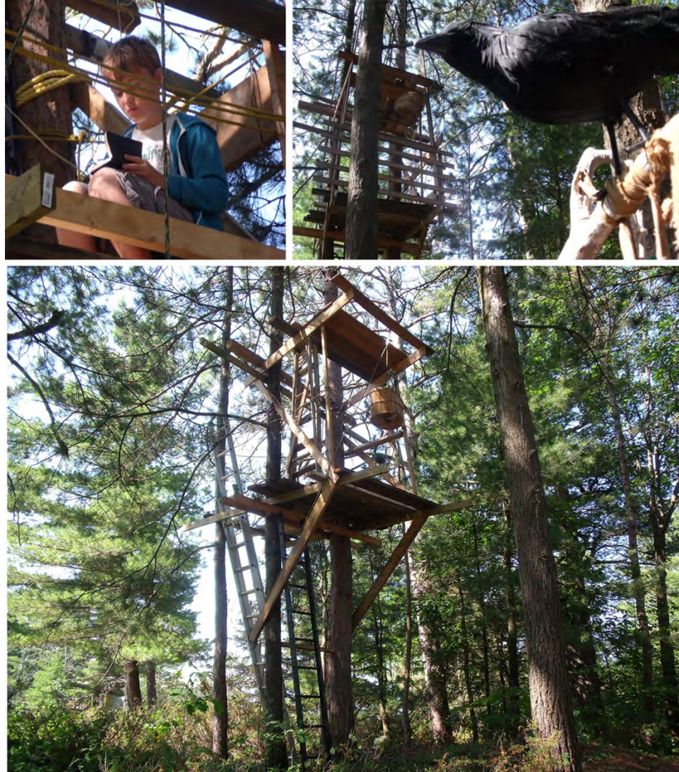
Image 2: Site as Simulation, The Crow's Nest , Georgian Bay, 2013, Patrick DeCoste.