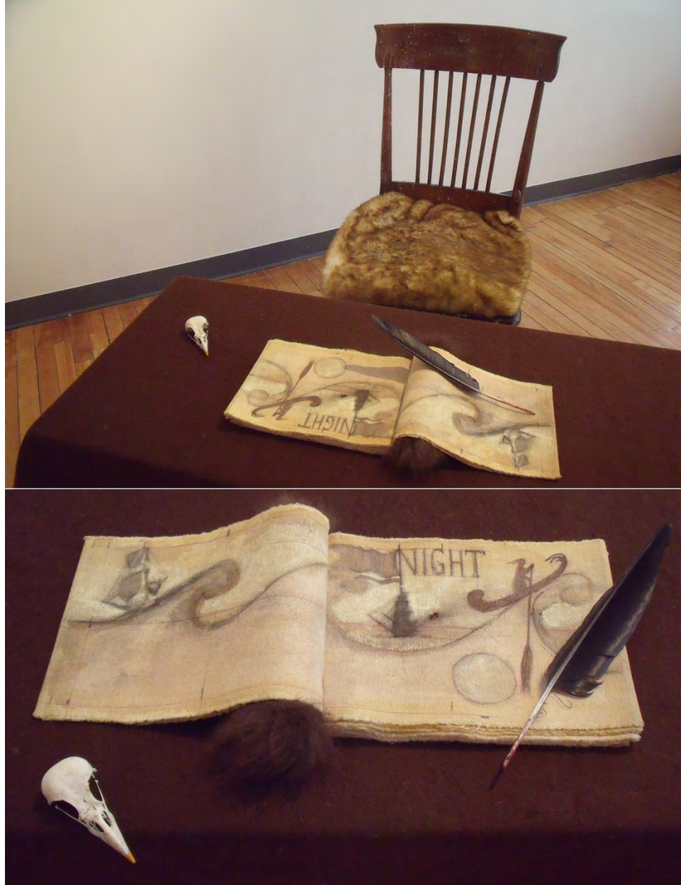
Image 11: The Dream , Patrick DeCoste, 2013, Book Work: pencil and acrylic on canvas, bound with mink fur. Reading & Writing Station: chair with faux fur, desk with felt, crow feather and skull.