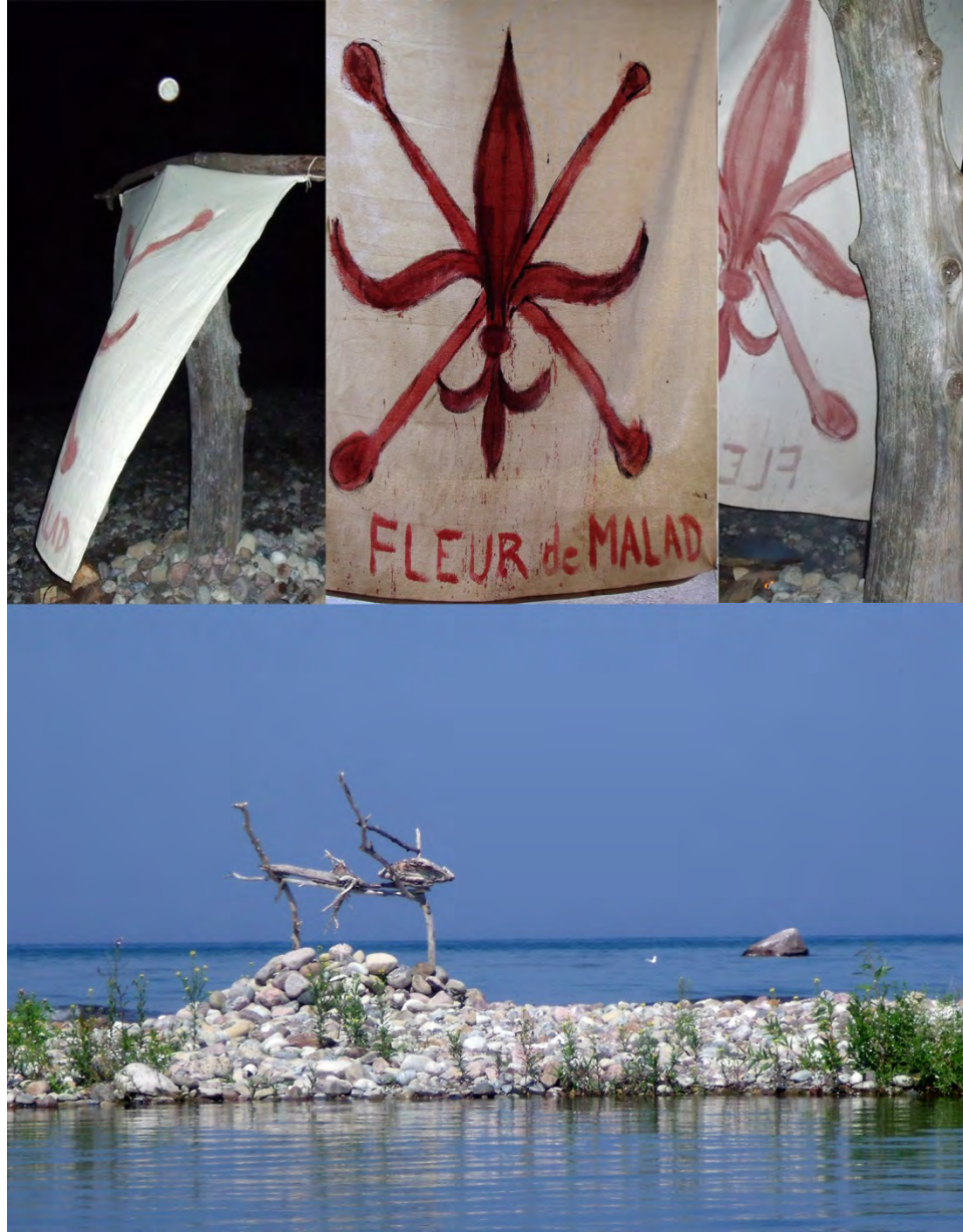
Image 3: Site as Simulation, The Floating Island , Georgian Bay, 2013, Patrick DeCoste.