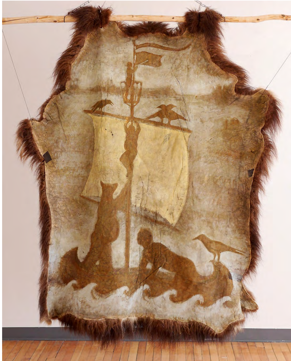
Image 6: The People of the Dream , Patrick DeCoste, 2014, acrylic on muskox skin, 6 x 6 feet.