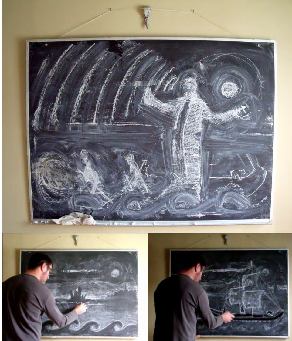
Image 12: The Floating Island , Patrick DeCoste, 2013, video, 3 min.