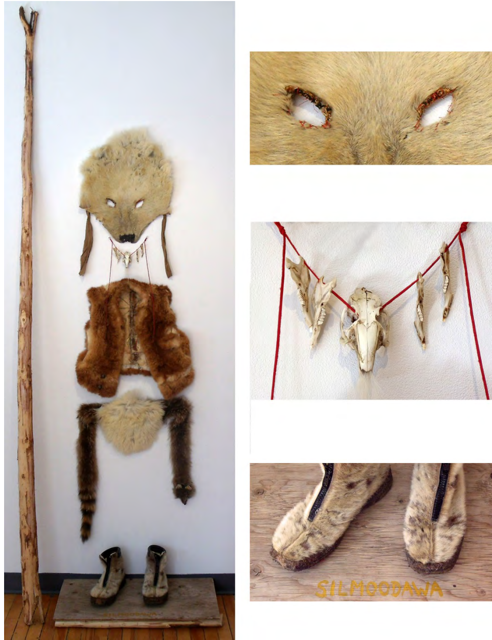
Image 10: The Man Dressed in Furs , Patrick DeCoste, 2014, various furs, rabbit bones, and wood, various dimensions.