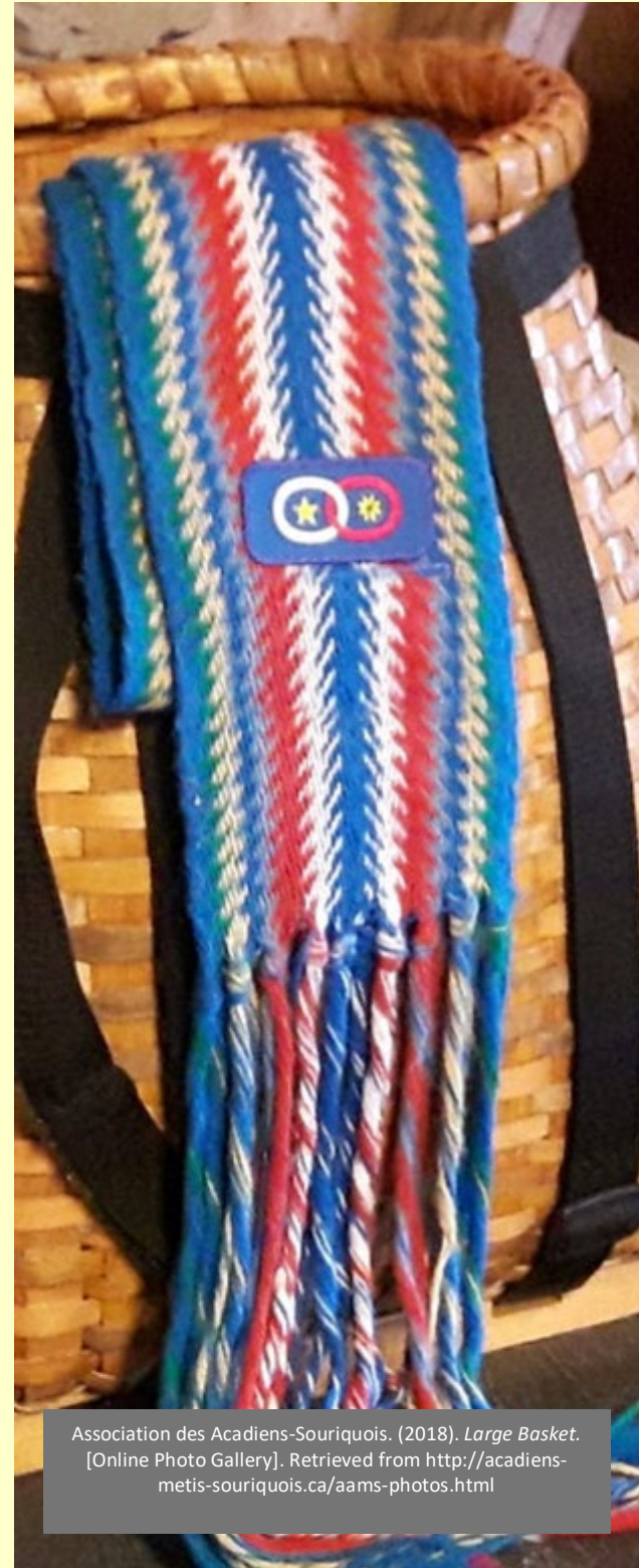
Association des Acadiens-Souriquois. (2018). Large Basket . [Online Photo Gallery]. Retrieved from http://acadiens-metis-souriquois.ca/aams-photos.html